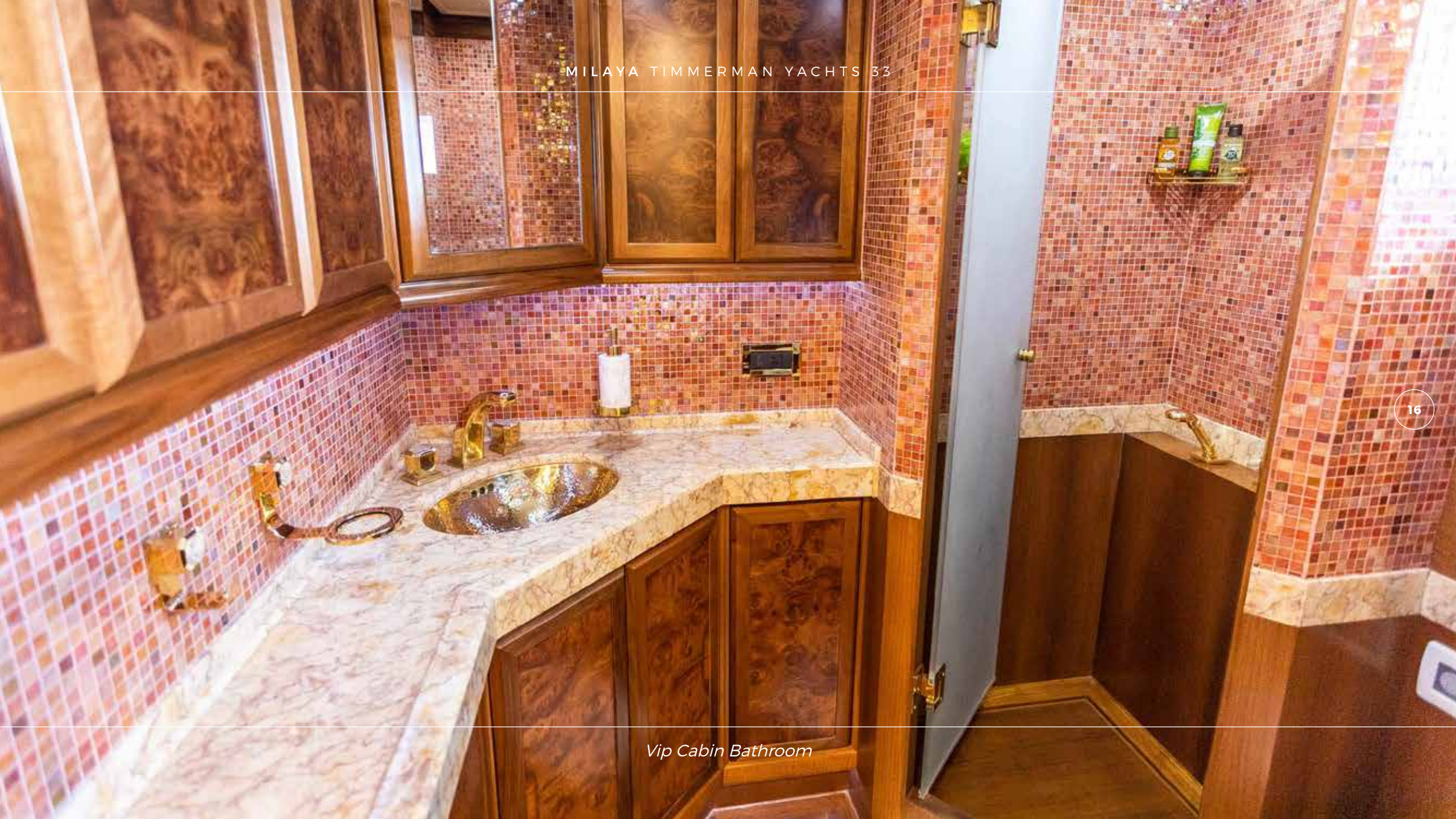
Vip Cabin Bathroom