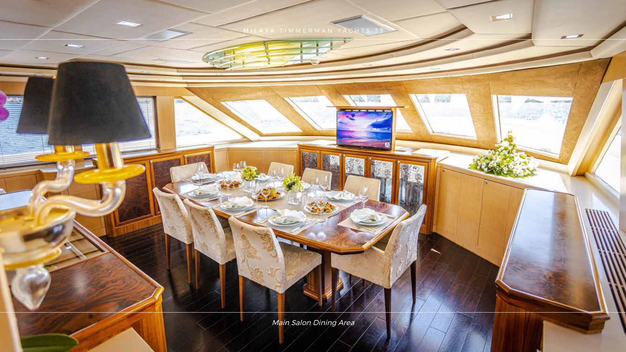
Main Salon Dining Area